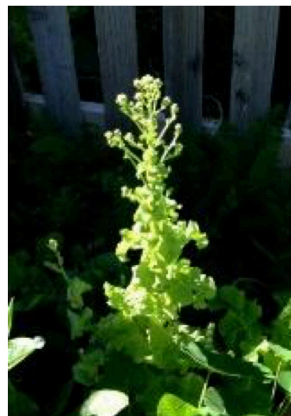
Bolting lettuce plant.

Bolting occurs when temperatures exceed 75 degrees during the day and 60 degrees at night. Once a plant bolts, the taste will become bitter and it's time to replant unless you plan to harvest the seeds first. To delay bolting, use taller crops or other shade provider. Harvest when full size but still young. Keeping the soil moist will also help delay bolting.